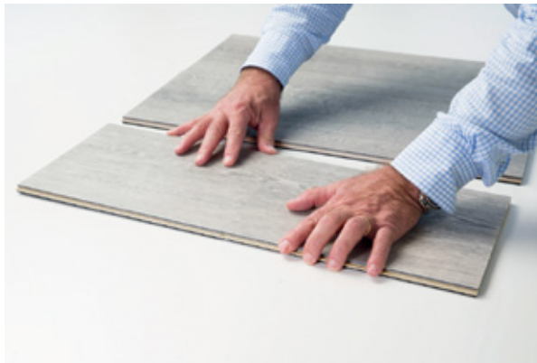
03: Place the planks gently on the floor