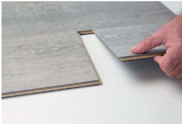
03: Let the plank drop gently