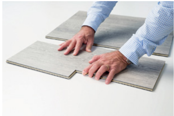
04: To disengage the short side, slide the planks in the opposite direction