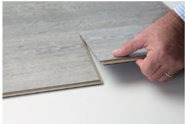
04: Press with your thumb on both ends of the short side