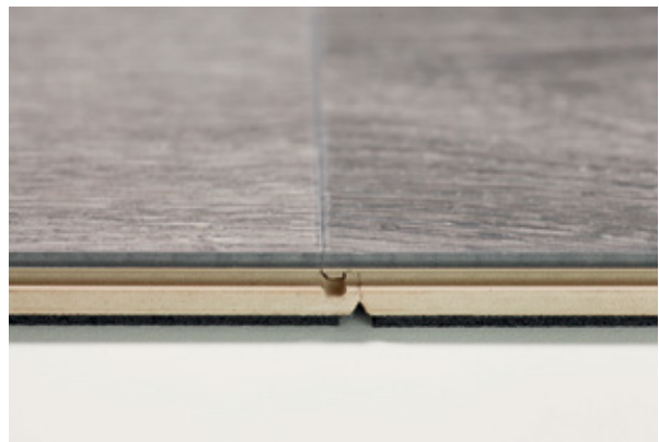
06: Planks are now fully inter-locked