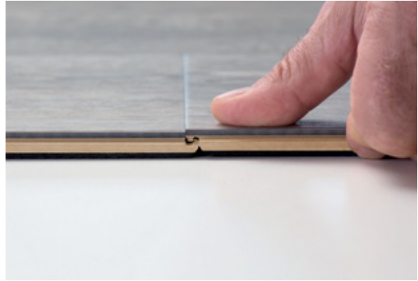
02: Slide the plank unit it reaches the short side of the next plank.