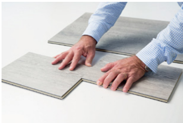
05: Press the planks gently while sliding