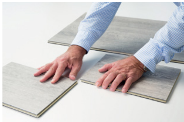
06: continue sliding until the planks are fully separated