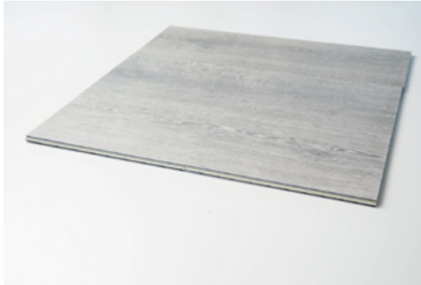
01: Always start by disengaging on the long side