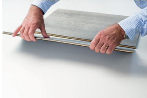
02: Grab the plank with both hands and gently lift until the plank disengages